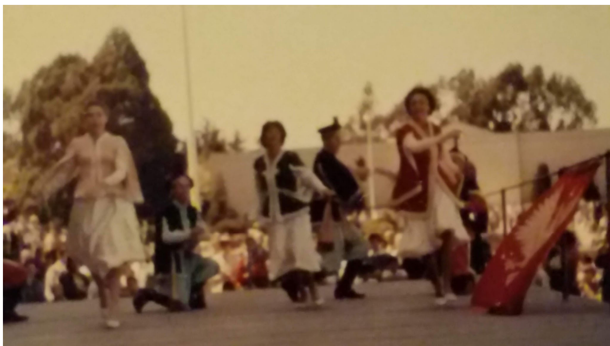
Gold Gate Park Bandshell