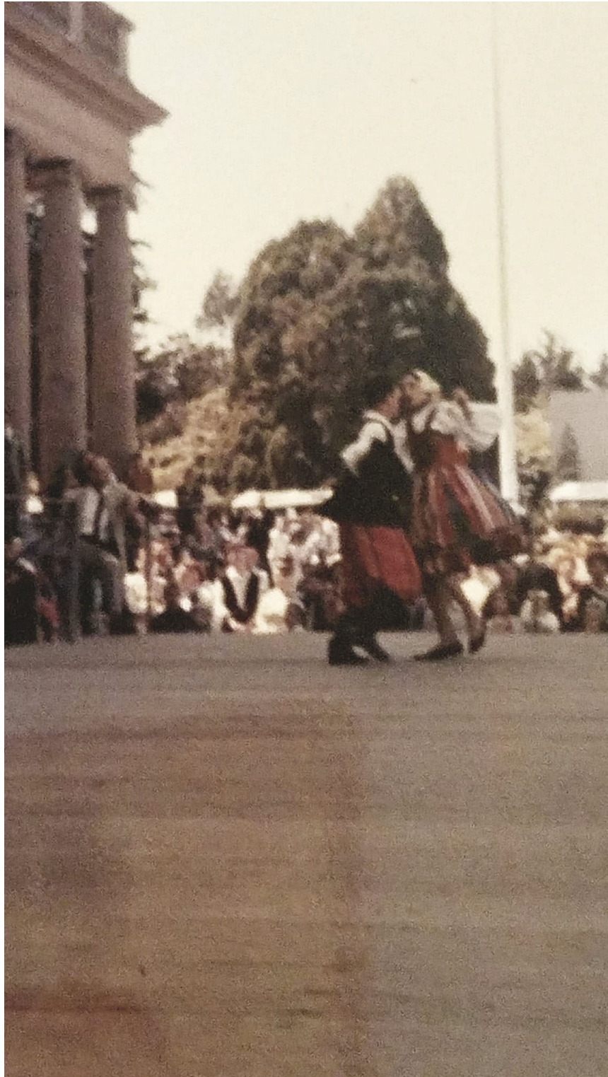
Golden Gate Park Bandshell