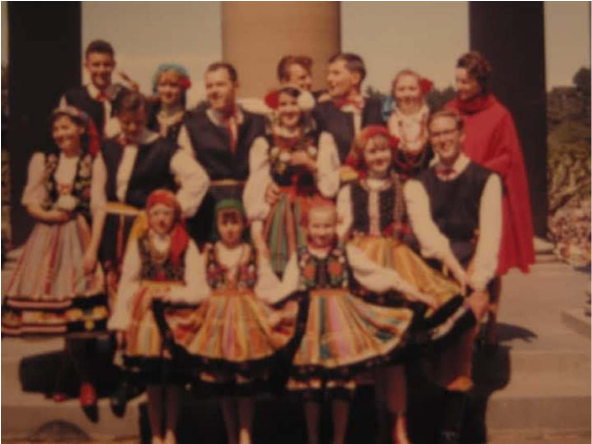
Gold Gate Park Bandshell