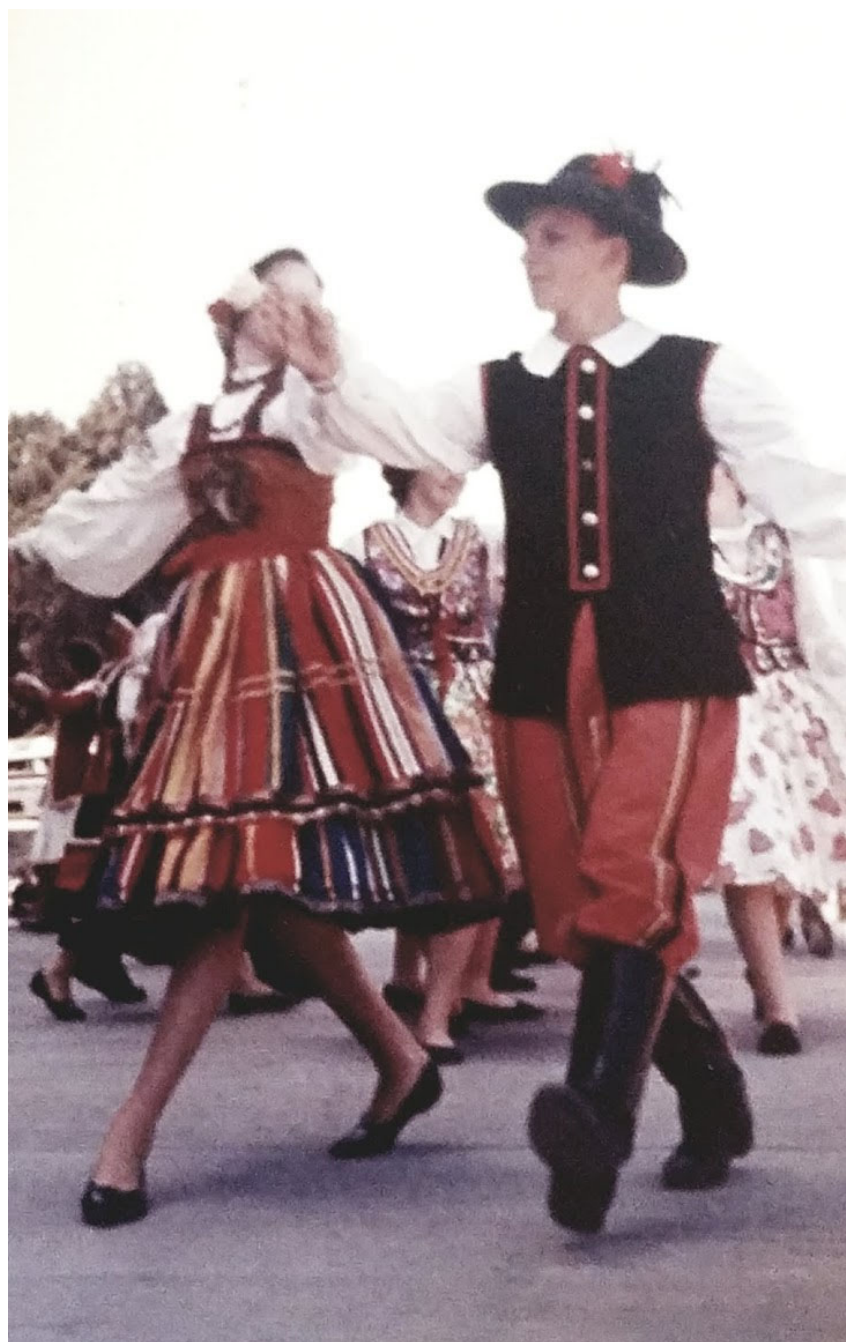
Gold Gate Park Bandshell