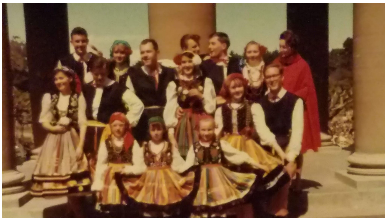
Gold Gate Park Bandshell