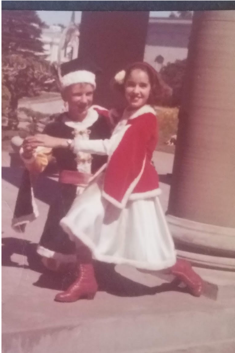
Gold Gate Park Bandshell