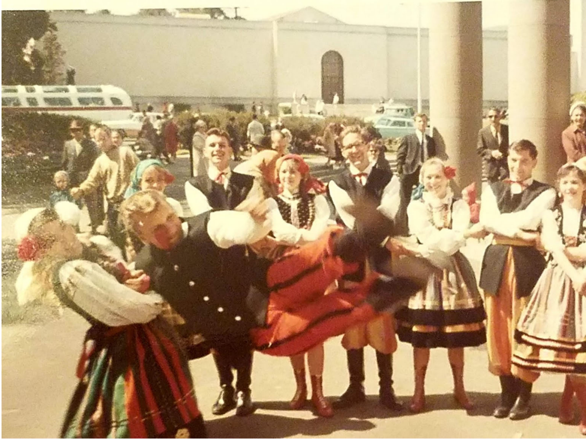
Gold Gate Park Bandshell