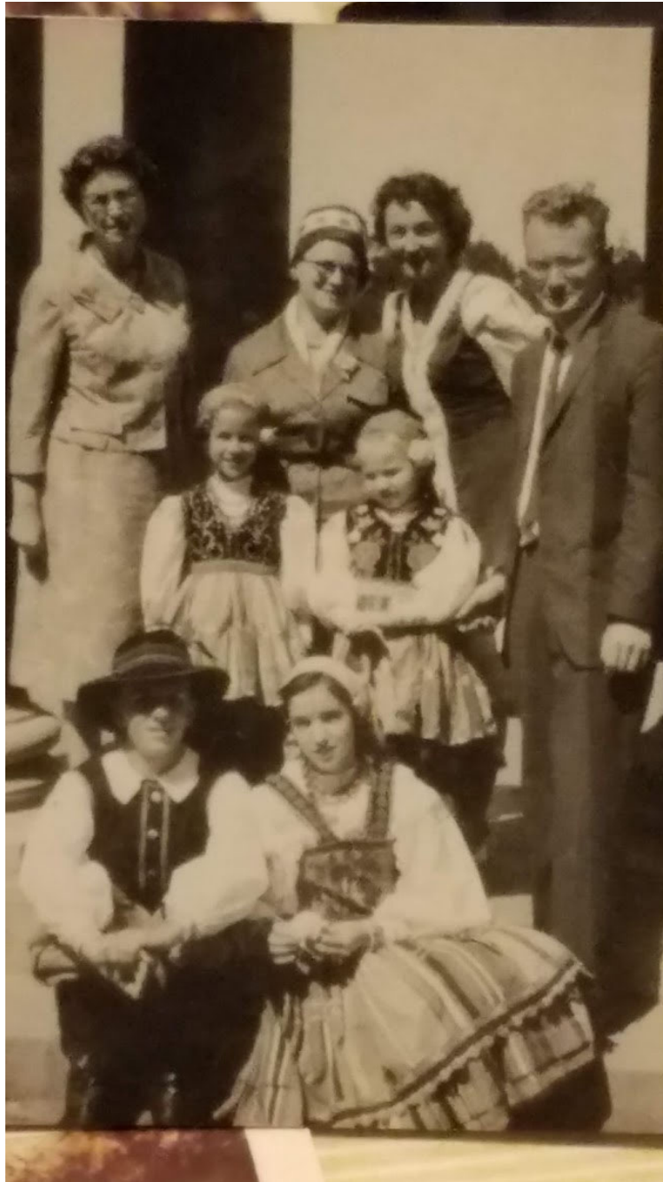
Gold Gate Park Bandshell