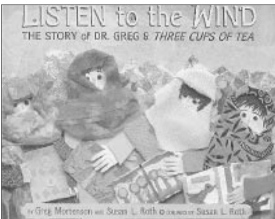
Listen to the Wind and see if it calls out the story of Three Cups of Tea .

When Greg saw these learning conditions, he vowed to build a school for Korphe. He returned to America. Destitute from his expensive trip to the second highest mountain in the world, Mortenson persevered until he had earned enough money to build the school and fulfill his promise. Against the odds of logistics, muddled politics and many obstacles, all of the villagers, even the children, helped to build Kor-